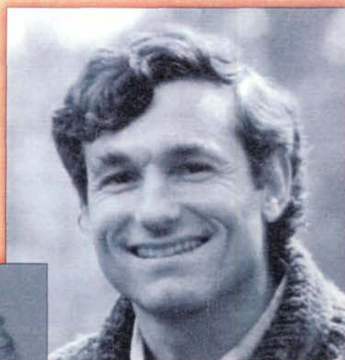
T. A. Barron THE MIRROR OF MERLIN Philomel/Putnam